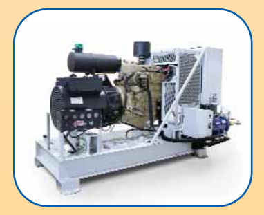
Save floor space with an optional rotary screw compressor / generator.