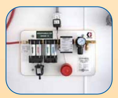
Martech system provides grade D quality breathable air.